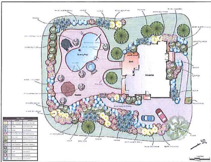
(Sample Landscape Plan)